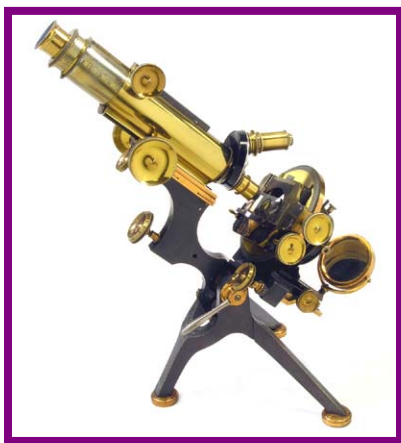
Antique Microscope (NYMS collection) as shown in the upper right corner of page one:

The microscope was made by Watson & Sons of London late 19. or early 20th. century. There is a similar one pictured in the catalog of the Billings collection fig.